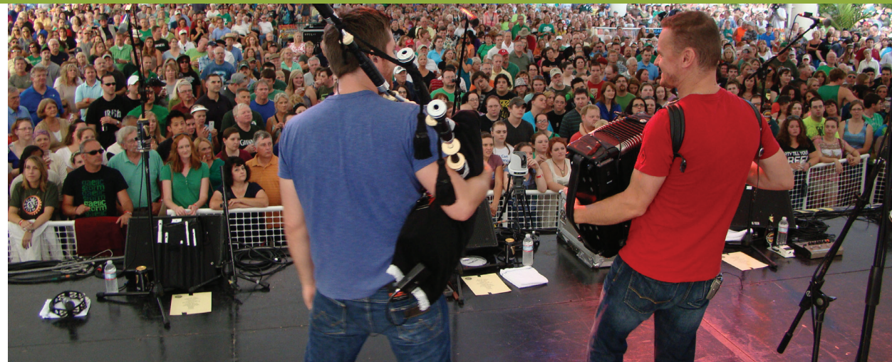
Gaelic Storm at the Dayton Celtic Festival

Please return the enclosed envelope today with your donation!