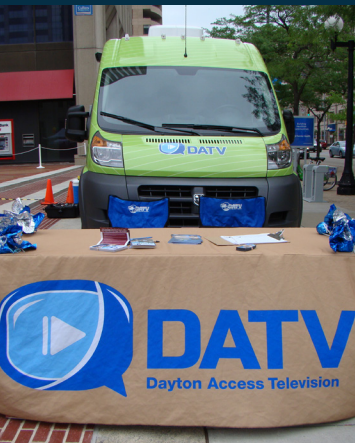
DATV's was on location at Courthouse Square for Pride Day 2015.