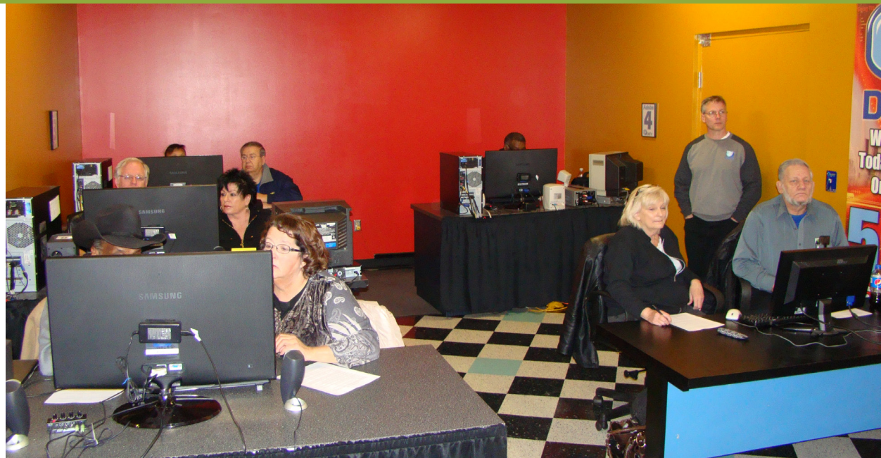
One of the newest specialty workshops at DATV is 3D animation using "Corel 3D."

Help Us Demonstrate How DATV Makes An Impact In Your Community