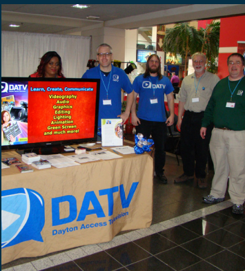
DATV recorded some new station IDs during the 2015 Dayton Home & Garden Show at the Dayton Convention Center.