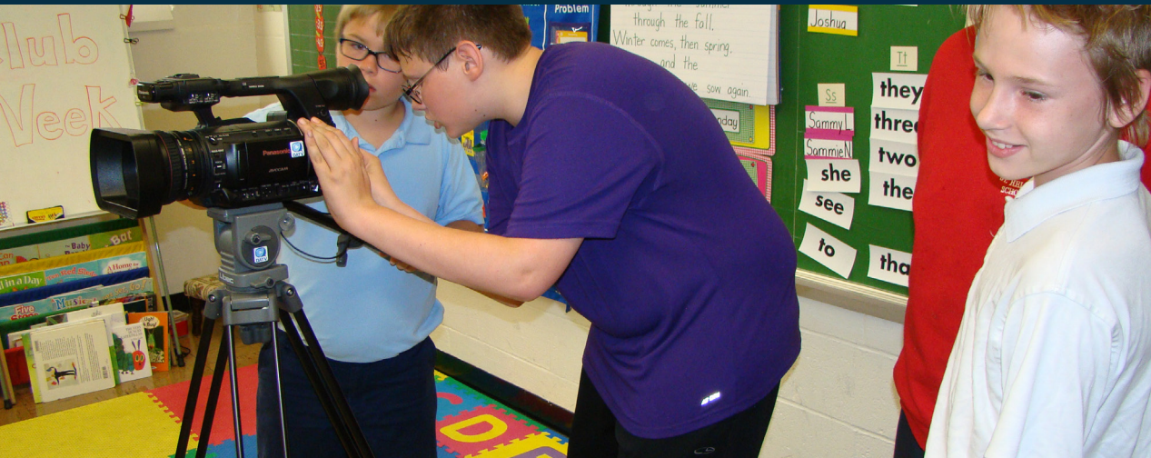
Learning In The Classroom At St. Helen’s.

Now why does it crash sometimes? I don’t have an answer for that yet. But we are working on a solution.