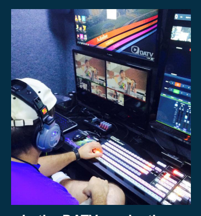
In the DATV production truck during the Dayton Reggae Festival at Dave Hall Plaza.