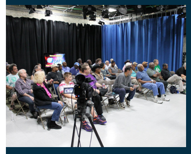
Thank you to all the DATV members who attended the Membership Meeting. We had some great feedback and we will try to make some of your suggestions work.

For assistance in how to use these in your next production, contact a member of the DATV production staff.