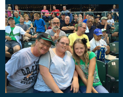
DATV members had a great evening at the Dayton Dragon's game on August 29th.